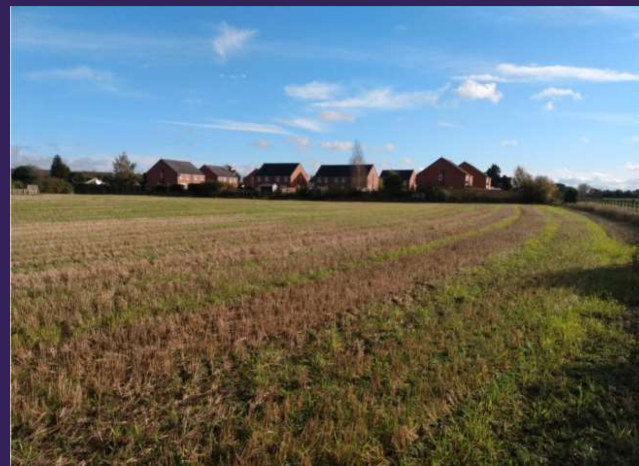
West corner looking south