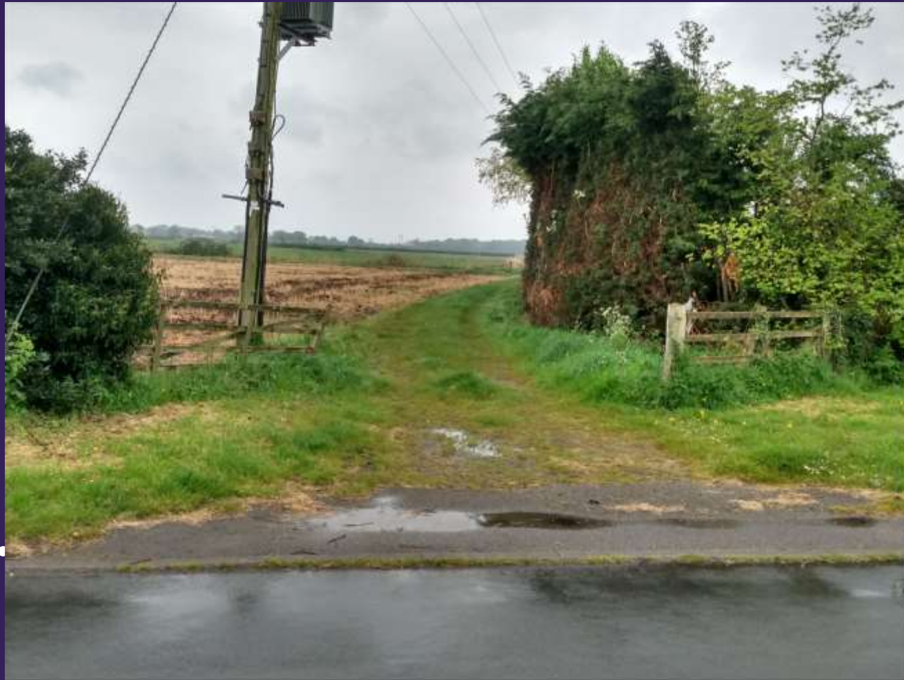
Site entrance off Sands Lane