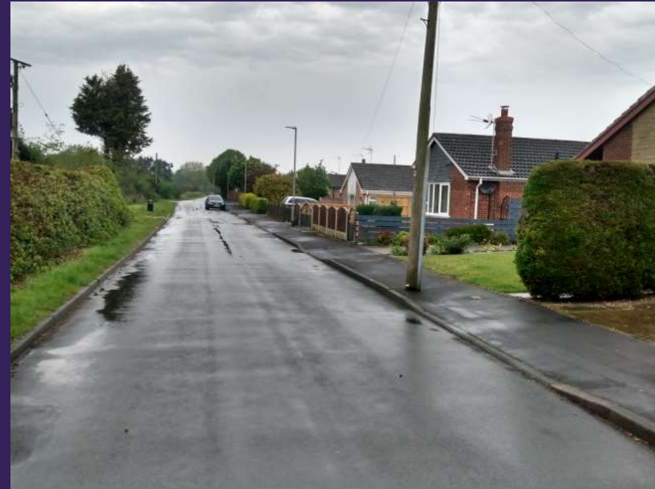
View down Sands Lane