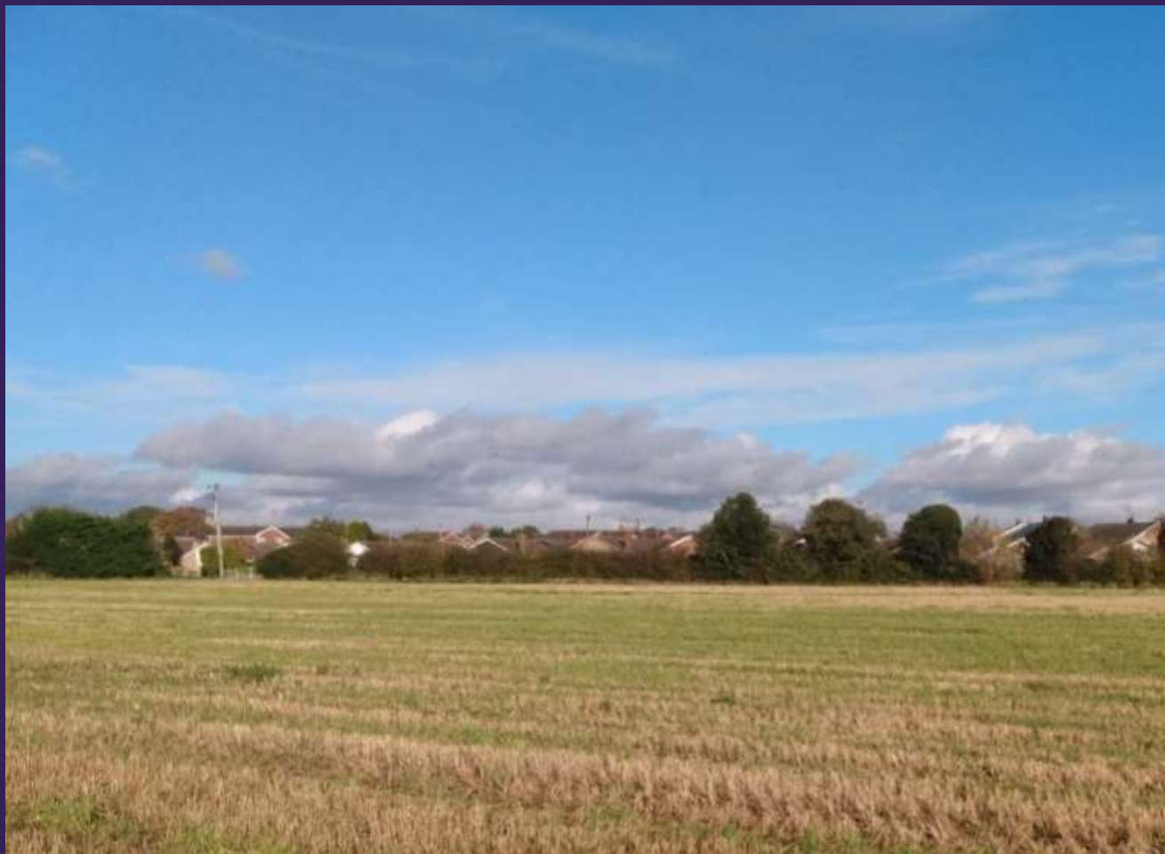
South corner looking north